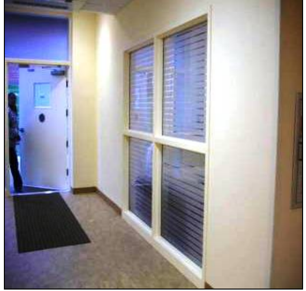
CPEP entrance after renovation

In addition, the voluntary program without incentives has been extended to December 31, 2009. If you want an application or have any questions, contact your HR representative.